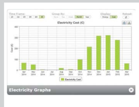
Low annual running costs