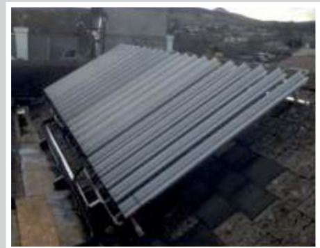
Roof mounted AirGo heat pump