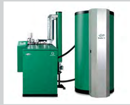
The Dachs SE Condensing Packaged System