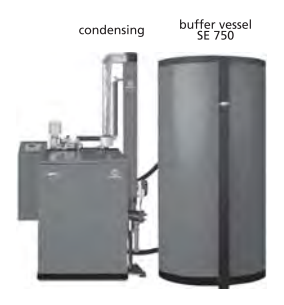
Dachs G/F SE condensing